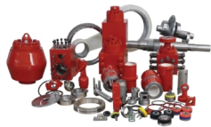
Fluid End Modules & Parts