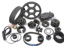
Power Transmission Products