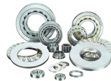
Bearings, Seals, Repair Kits