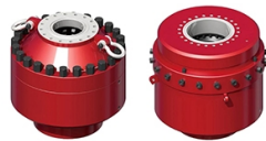
Well Control Products