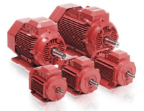
AC/DC Motors & Drives