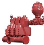
7500PSI Upgrade Kits